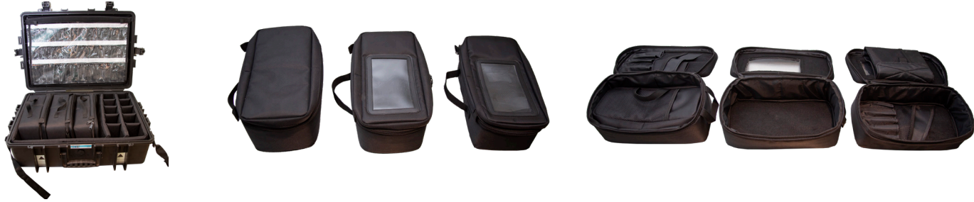
MedShield-300 Large Medical Case with modular medical packs and reconfigurable machine washable padded dividers

MedShield customized medical cases are also available with individual medical insert packs: the injectables pack, the fluids pack, and the universal medical insert pack. This provides flexibility with the design layout. Our MedShield-300 medical case can hold all three packs and some reconfigurable washable padded dividers. The MedShield-200 medical case can hold the individual medical packs or reconfigurable washable padded dividers.